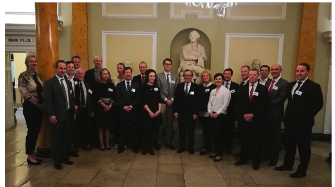
Irish Shoulder and Elbow Society Group