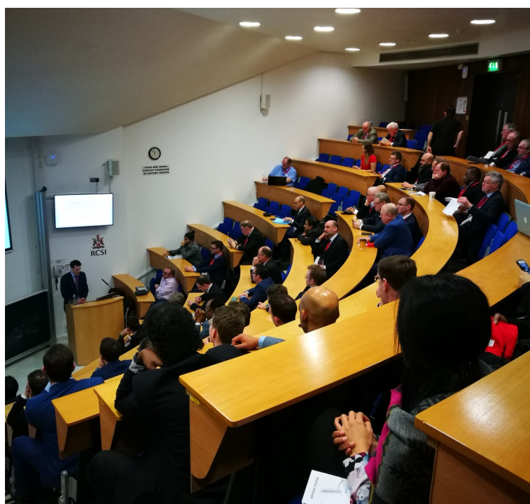
Charter Day - T&O Session with Emergency Medicine, Transitioning to Major Trauma Care. Full programme here